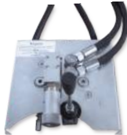
Hydraulic hoses with speed adjustment, 5 m Order-No. 003.558.04