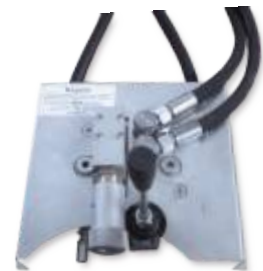
Hydraulic hoses with speed adjustment, 5 m