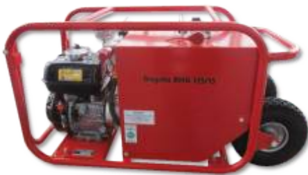
Hydraulic Power Pack with petrol engine type BHA 125/15

The connecting hoses between the BKS 400 and the power pack are equipped with a flow divider, which guarantees the infinitely variable adjusting of speed.