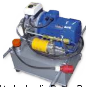
Elektrohydraulic Power Pack BHA 120/12