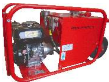
Hydraulic Power Pack with petrol engine type BHA 200/10 Order-No. 010.120.01